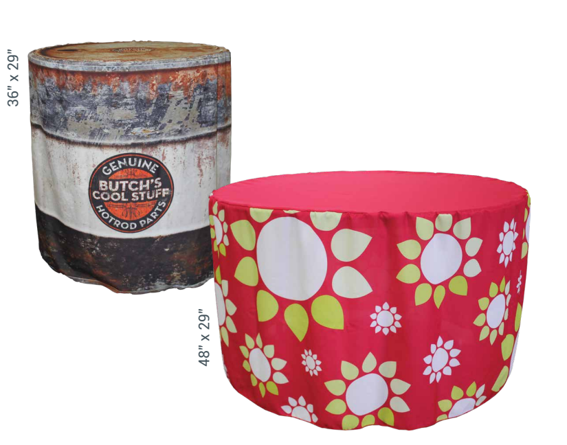
Table cover not included with runners Standard lead time 5 days after artwork approval Rush options available