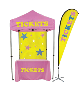
5' x 5' • PACKAGE 7D

Aluminum Frame - $1,726.76 Steel Frame - $1,456.76