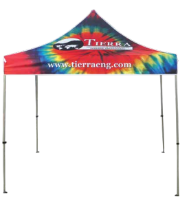
10' x 10' • PACKAGE 10-3

Aluminum Frame - $839.90 Steel Frame - $733.69