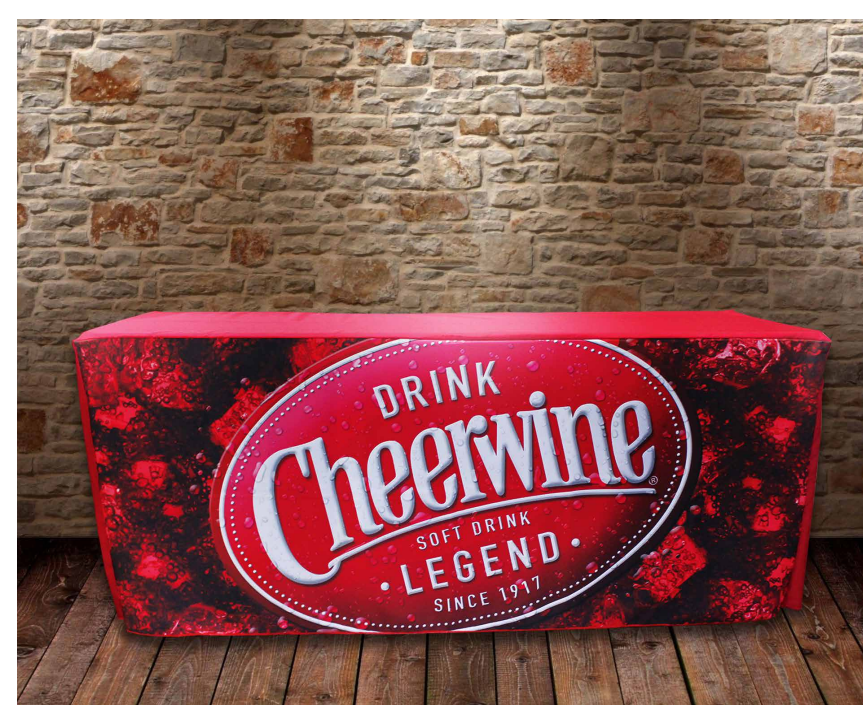
6' Fitted Table Cover (6' Wood Folding Table sold separately)