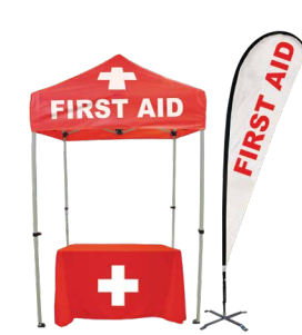
5' x 5' • PACKAGE 7G

Aluminum Frame - $2,317.76 Steel Frame - $2,047.76