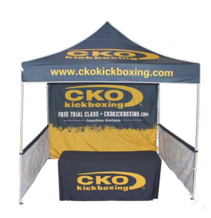
10' x 10' • PACKAGE 10-7

Aluminum Frame - $1,737.08 Steel Frame - $1,625.27