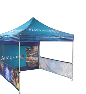
10' x 10' • PACKAGE 10-1

Aluminum Frame - $1,453.88 Steel Frame - $1,342.07